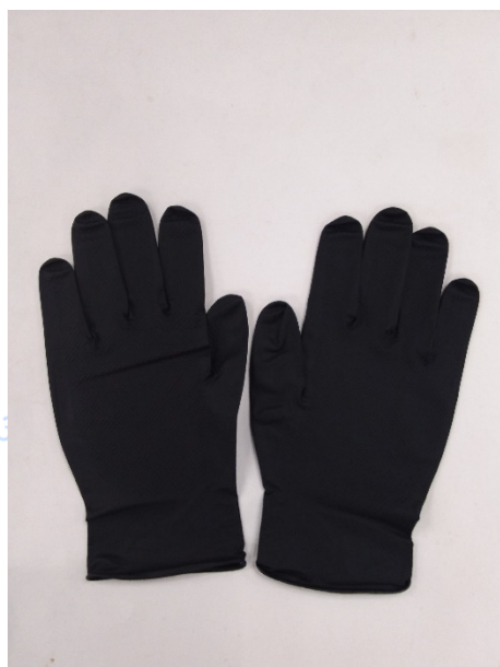
Samples described as Fishscale Powder Free Nitrile 6 mil 240 mm Black